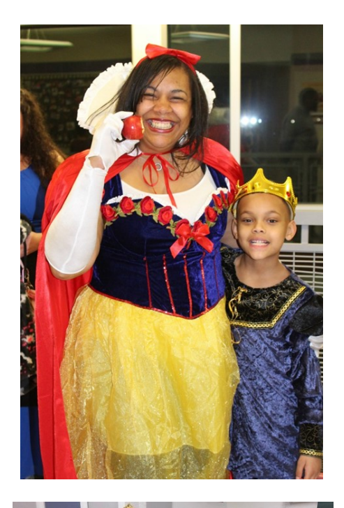
PTA Magical Fairy Tale Dance